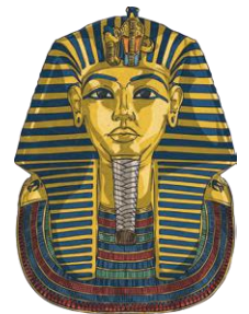
Tutankhamun's death mask

The discovery helped people to understand more about the Egyptians pharaohs .